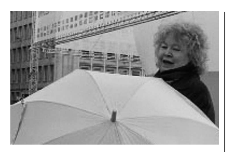
Jean warns of the climate change crisis we face.