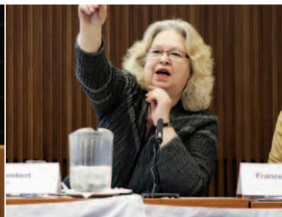
Jean chairs an event at the TUC Congress Centre discussing sustainable finance.