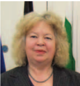
Jean Lambert Green MEP for London 1999-Present