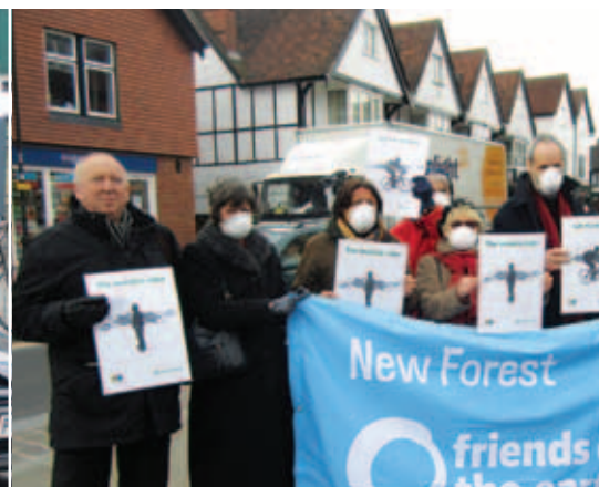
As part of a tour of South East England Keith joined Friends of the Earth campaigners in the New Forest as they fight for cleaner air.